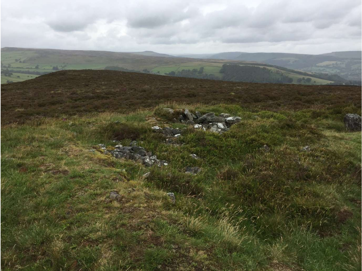
Stone ring cairn with external earth mound.