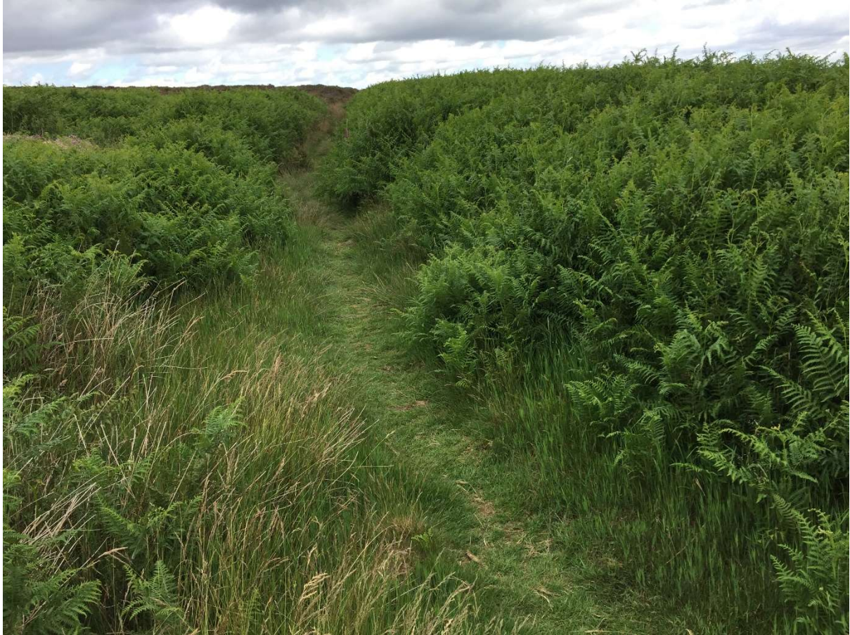
A packhorse trail