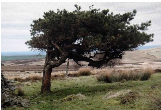
Windswept pine as it used to be

Several windsculpted pine and larch were left behind when Rape Piece plantation was felled for timber in the early 1900s. These were 'edge' trees which were stunted by the wind, and not worth harvesting for timber.